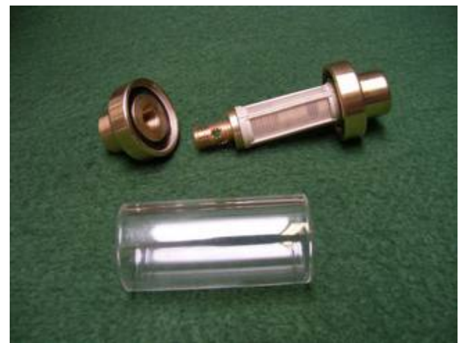
100 micon filter (easily removable for cleaning!)